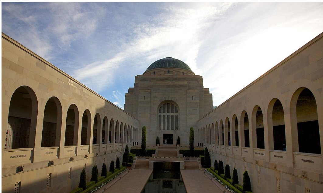
Commemorative Area of the Australian War Memorial