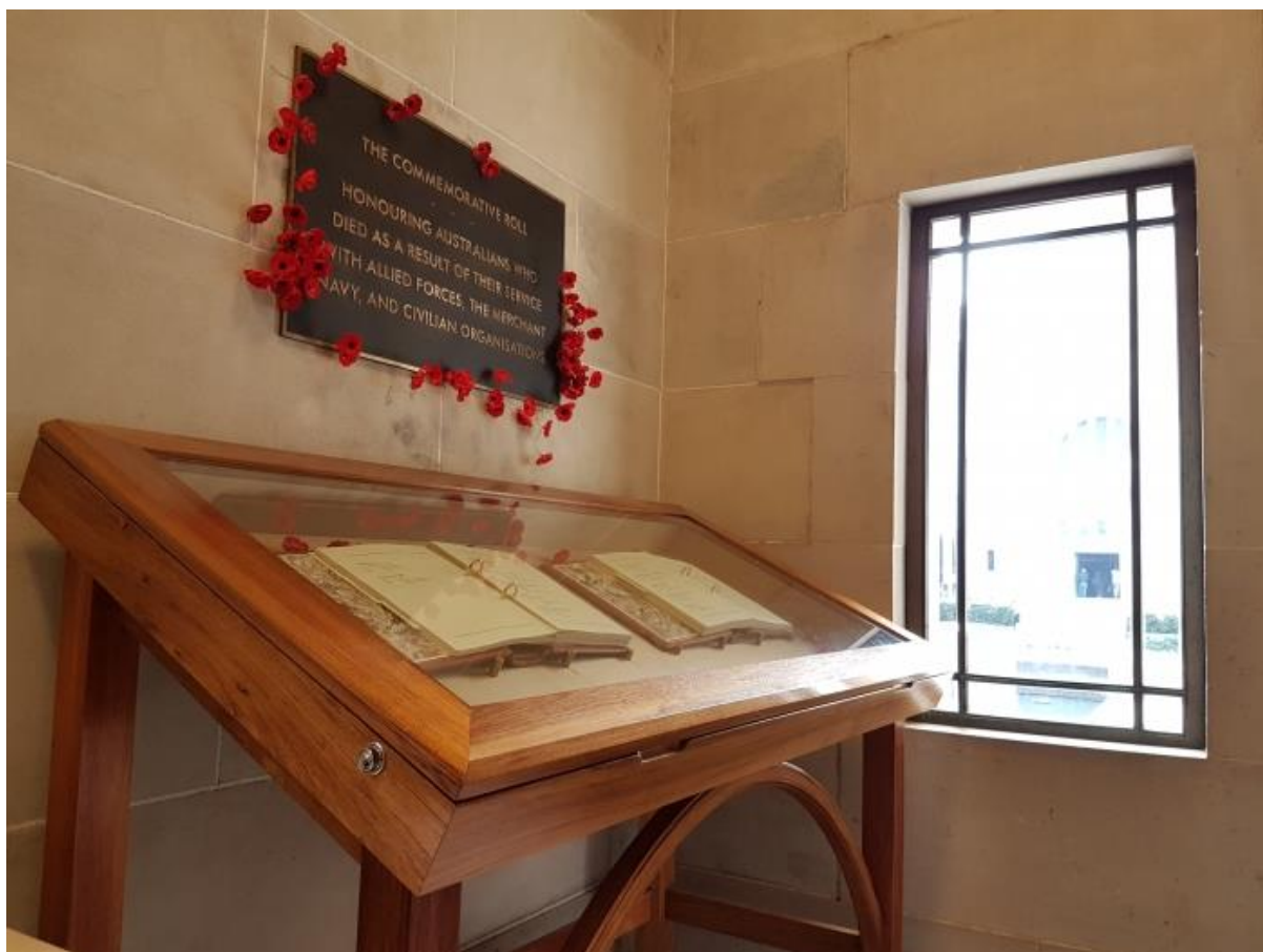
Commemorative Roll