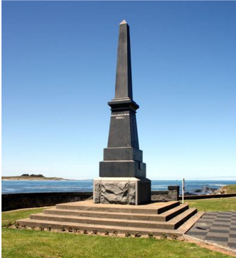
The Bluff War Memorial